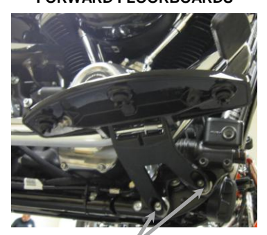
REMOVE THESE LOWER BOLTS