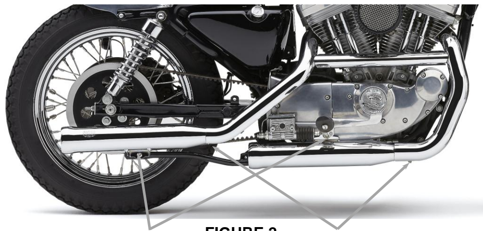
FIGURE 2 STOCK BOLTS